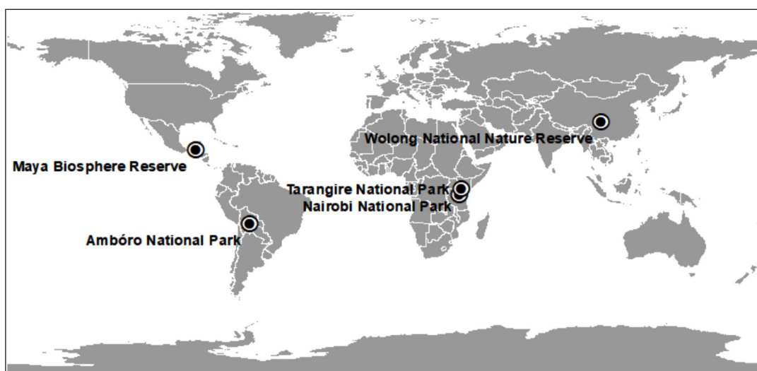
Figure 1 Localisation of the protected areas considered in this study

In the second stage, two questions guided the study: i) What factors were preponderant to the success or failure of related PES initiatives? ii) What is the relationship between PES and other strategies that aim to conserve biodiversity and environmental services, and to smooth the conflicts of “parks versus people”? To answer the first question, four aspects were considered: the amounts paid to the populations involved and the opportunity costs to join PES, the valorisation